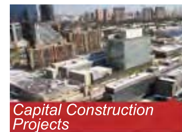
Capital Construction Projects

If you newly arrive in Beijing travel stained, then warm and comfortable guest rooms of the Beijing International Club (with St. Regis Beijing as part of it) will wait for you entering a sweet dream; if you want to engage an employee for your embassy so as to get a local assistant for yourself, high-caliber professionals of various types and using different foreign languages will provide you with satisfactory service; If you wish to learn Chinese and get some ideas about the Chinese culture, interesting and practical Chinese language courses suitable for seniors and juniors will beckon to you; if you want to use a car with or without a driver, cars in different grades for rental will be delivered to you; if you want to do some shopping, both affordable and superior quality commodities will throw themselves into your embrace. Log onto www.bds-cn.com right now to enjoy all the niceties we could offer to you!