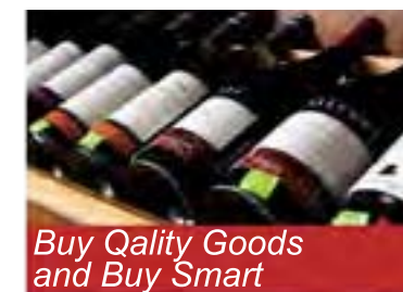
Buy Quality Goods and Buy Smart

Rent a car from the Ring-Do Car Rental Center, you just take me(the driver cum guide), and I will take you to Beidaihe with smiles!