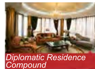
Diplomatic Residence Compound

Consultancy and service with regard to diplomatic construction projects; we are the only one of its kind throughout China!