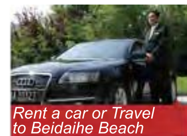
Rent a car or Travel to Beidaihe Beach

For the use of office or apartment? Which one of the prime locations would you like to choose? How many bed-rooms are most ideal to you? Just contact the DRC agent, we will immediately arrange for the pre-rental and on-the-spot examination of the offices or apartments!