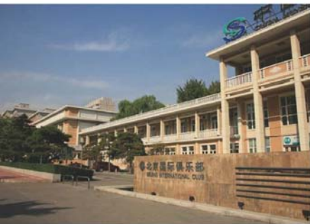
Beijing International Club

In 1950, Beijing Club was put under the leadership of the newly founded Ministry of Foreign Affairs of the People’s Republic of China and renamed International Club. In 1972, under the late Premier Zhou Enlai’s personal care, the brand new “Beijing International Club” was built at its present location of Jianguomenwai. It was regarded as one of the three grand buildings then on the Chang’an Avenue, enjoying the same reputation