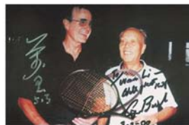
In mid 80's of the 19th century, George Bush visited China. On the sidelight of the visit, he had a pleasant picture taking together with then Vice Premier Wan Li following the Sino-U.S. Tennis Competition at Beijing International Club. This photo bears their autographs.