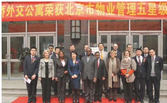
Foreign diplomats and expats gathered in the Liangmaqiao Diplomatic Residence Compound on Tuesday to celebrate the compound's success in winning a Beijing Five-Star Property Management rating.